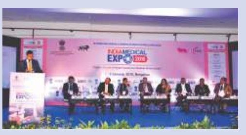
Session: Success Stories of Make in India in MedTech