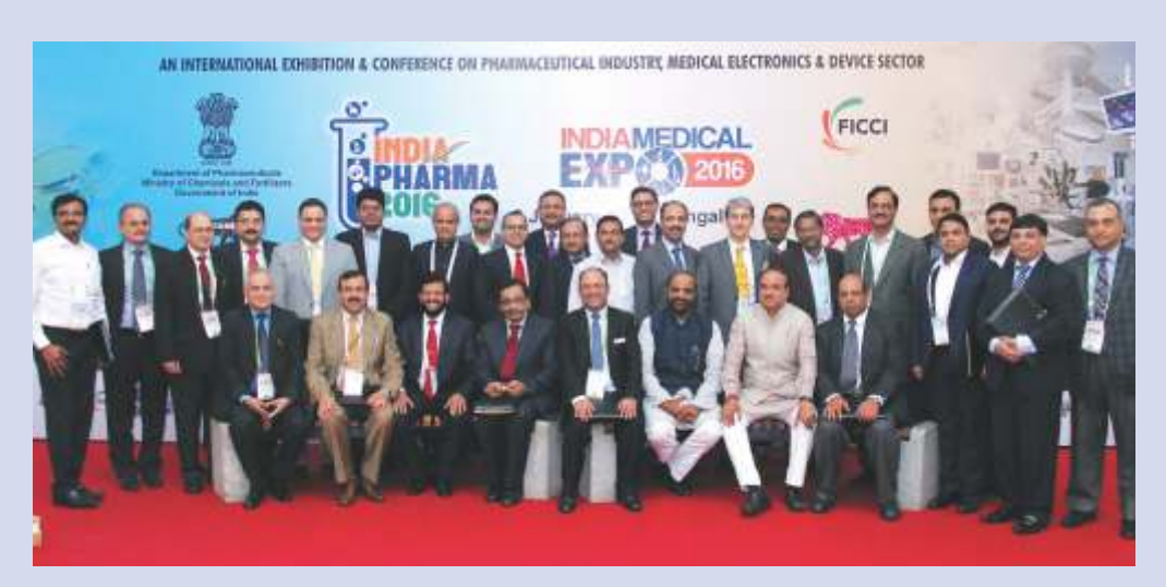
Dignitaries from Government of India & Medical Device Industry Leaders at CEOs Roundtable in India Medical Expo & Conference: January 7 - 9, 2016 at BIEC, Bengaluru

India Medical Expo hosted an exclusive Medtech CEO's Roundtable comprising of the who's who of India's Medtech industry including start-ups and SMEs. The roundtable was chaired by Shri Ananth Kumar, Hon'ble Minister of Chemical & Fertilisers, Govt. of India in the august presence of eminent decision makers from other ministries related to medical device industry. Deliberations were focussed on filling gaps and paving the way forward for meeting India's unmet Healthcare issues and at the same time positioning India's medtech industry as a strong player on the Global map.