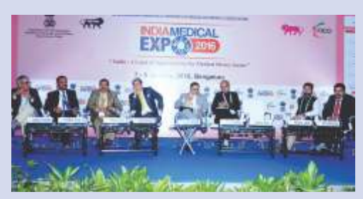
Session: Policy Interventions in MedTech

The Conference sessions led to an insightful sharing of facts, knowledge and experiences by eminent speakers belonging to varied stakeholder groups. Delegate participation was full of enthusiasm and ushered an interactive Q-A session after each session.