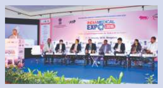
Session: Bridging Gaps - Scaling Start Ups